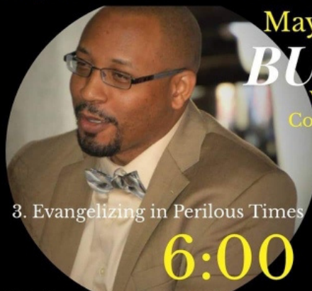
3. Evangelizing in Perilous Times